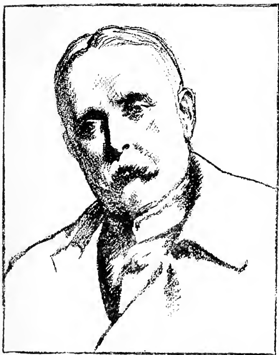
Sir John French